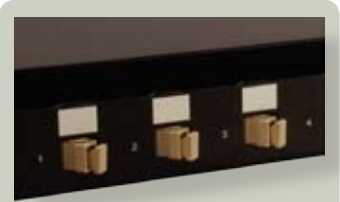
Easy panel identification labelling