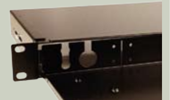
Cable entry 4 x 10mm gland holes 2 x 20mm gland holes